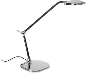
Table lamp Queen LED 6.9W LED warm-white 3000K ON-OFF Chrome 284lm